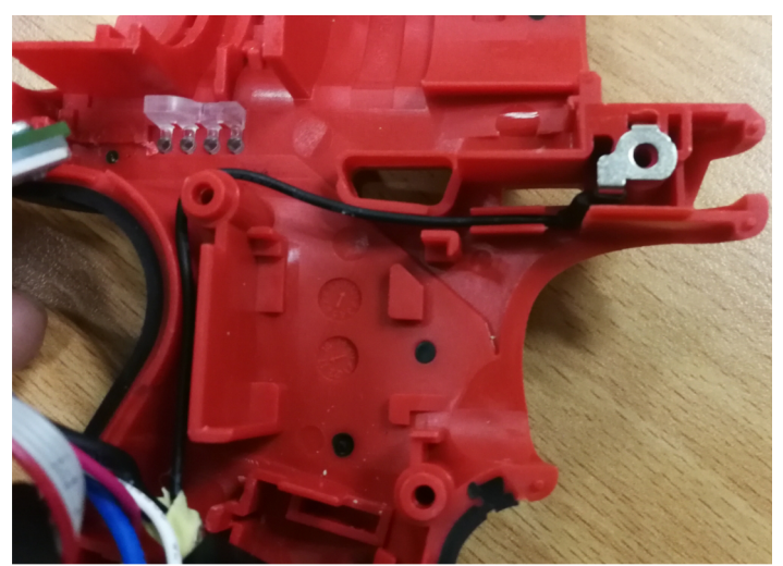
STEP 2: Assemble HV terminal over screw boss and route HV terminal wire through channels and traps as shown.