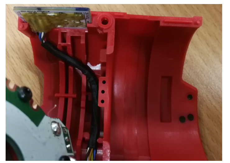
STEP 5: Install the pop switch into housing halve as shown. Route wires through traps being sure wires are tucked completely down.