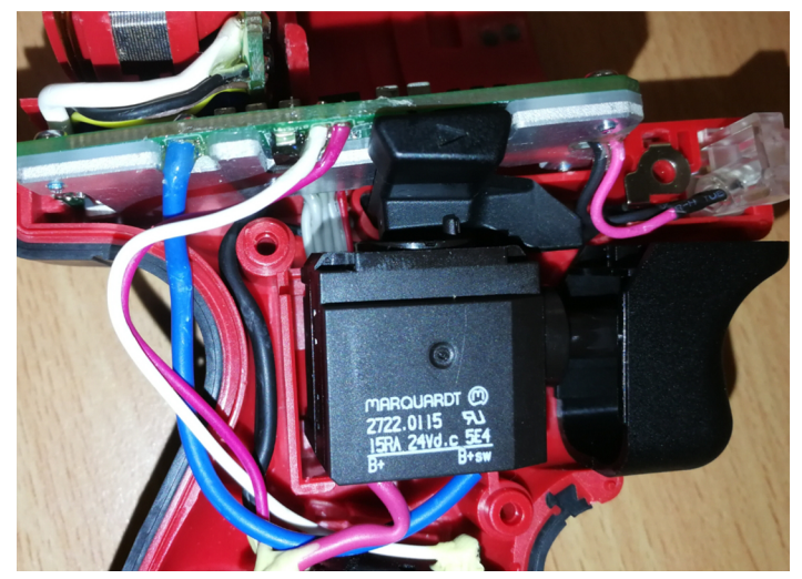
STEP 7: Install forward/reverse shuttle and on-off switch into left housing halve-support. Be sure shuttle is properly seated over the forward/reverse tab on top of on-off switch.