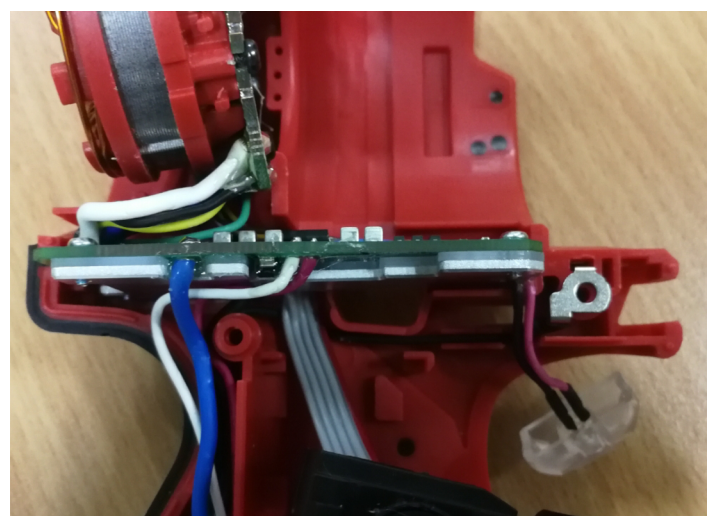
STEP 3: Assemble PCBA into corresponding housing cavity as shown.