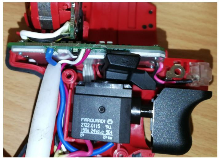
STEP 9: Use a plastic/nylon instrument to carefully press blue wire into housing cavity, over the battery terminal wires.