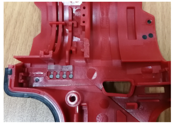
STEP 1: Insert light pipe in cavity of left housing halve-support.