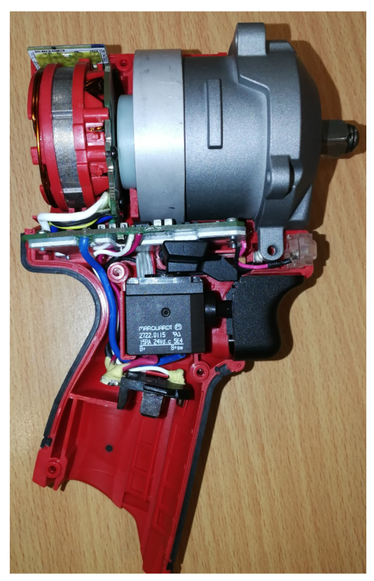
STEP 11: Assemble the gear case assembly onto the left housing halve and secure with two gear case screws.

Check that all elements of electronics assembly are seated properly and that all wires are pressed completely down in wire traps and channels.