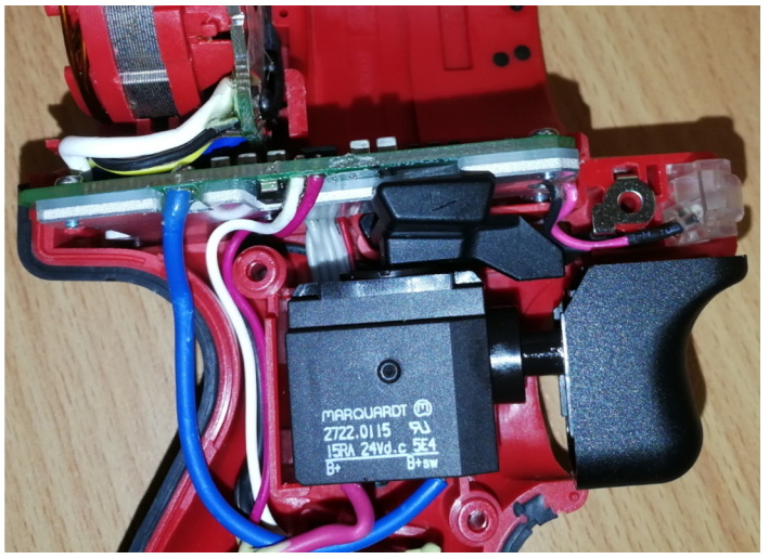
STEP 8: Route the PCBA wires connected with battery terminal into the wire channel of left housing as shown.