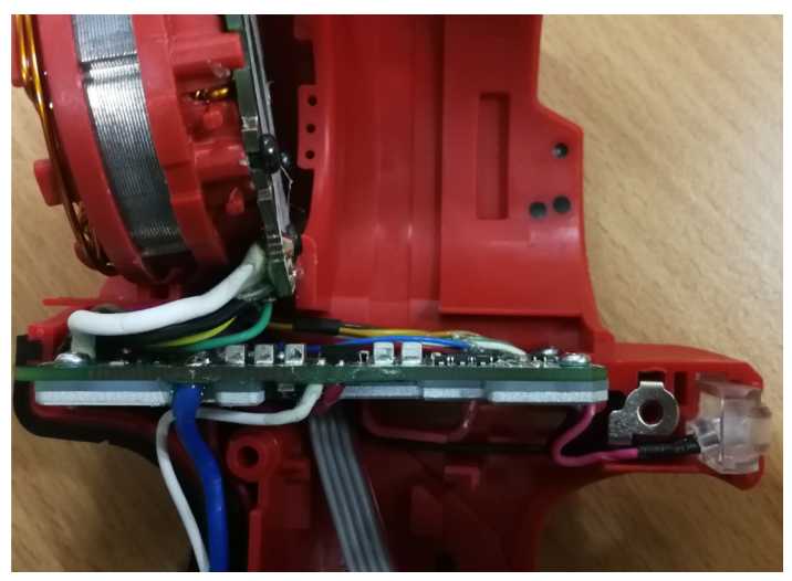
STEP 4: Install LED lens and tuck LED wires down in housing cavity, over HV terminal wire.