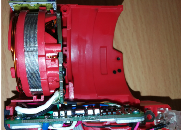
STEP 6: Assemble stator over pop switch wires. Be sure stator is seated firmly and squarely in housing halve.