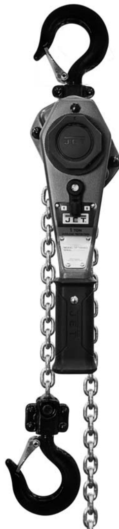
1 Ton model shown

JET 427 New Sanford Road LaVergne, Tennessee 37086 Ph.: 800-274-6848 www.jettools.com