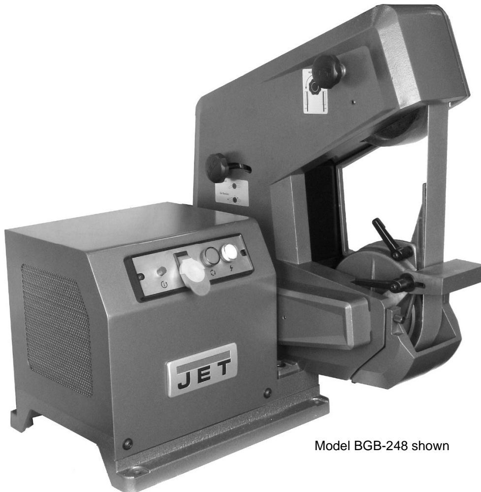
Model BGB-248 shown

JET 427 New Sanford Road LaVergne, Tennessee 37086 Ph.: 800-274-6848 www.jettools.com