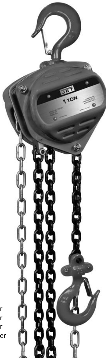
1-Ton model shown

For S90-100 serial no. 15070361H and higher For S90-150 serial no. 15070389H and higher For S90-300 serial no. 15070605H and higher For S90-1000 serial no. 15070767H and higher